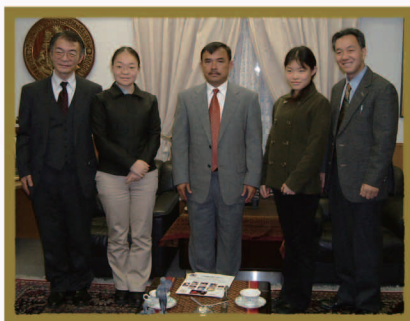
With Cambodian Ambassador in Japan

Our most recently launched project. The goal of this project is the creation and distribution of Children's story books for underprivileged children in Asia, living in severe environments caused by poverty and/or disasters. We believe that these books will give them hope and encouragement as well as instill in them a positive outlook on life and help them to look forward to a brighter future.