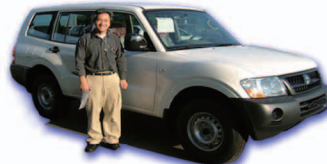
Items sent to Cambodia in 2005